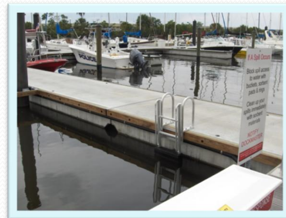
PUNTA GORDA, FL CITY DOCKS